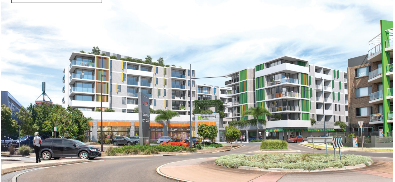
Figure 5: Photo of the existing site taken from the roundabout to the north-west of the site (the main vehicular access to the site and surrounding residential developments looking south-east (above).

Photomontage of the proposed development taken from the roundabout to the north-west of the site (the main vehicular access to the site and surrounding residential developments) looking south-east (below). The existing supermarket and commercial building are shown on the left and the existing 4 storey residential development is shown on the right.