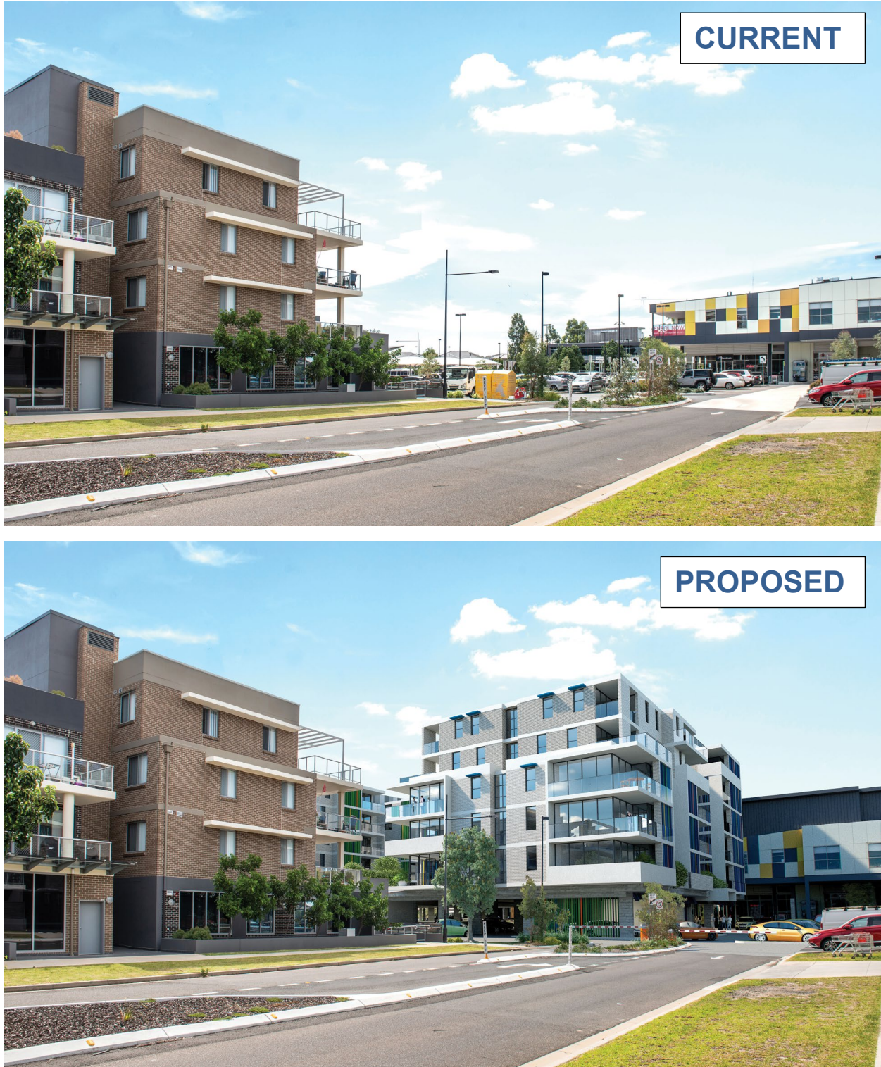
Figure 1: Photo of the existing site taken from Drummond Avenue looking north (above). Photomontage of the proposed development taken from Drummond Avenue looking north (below).