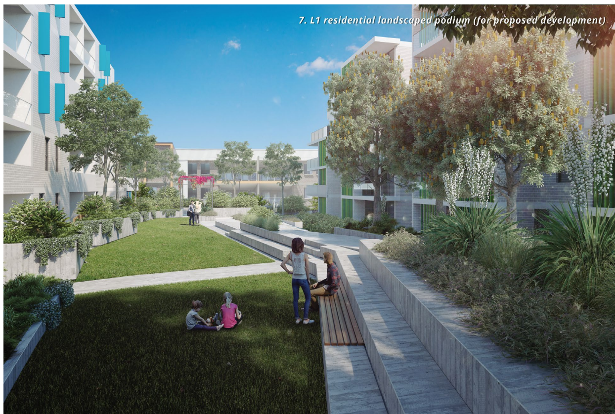
Figure 7: Photomontage of the landscaped communal open space area on the podium level of the proposed development.