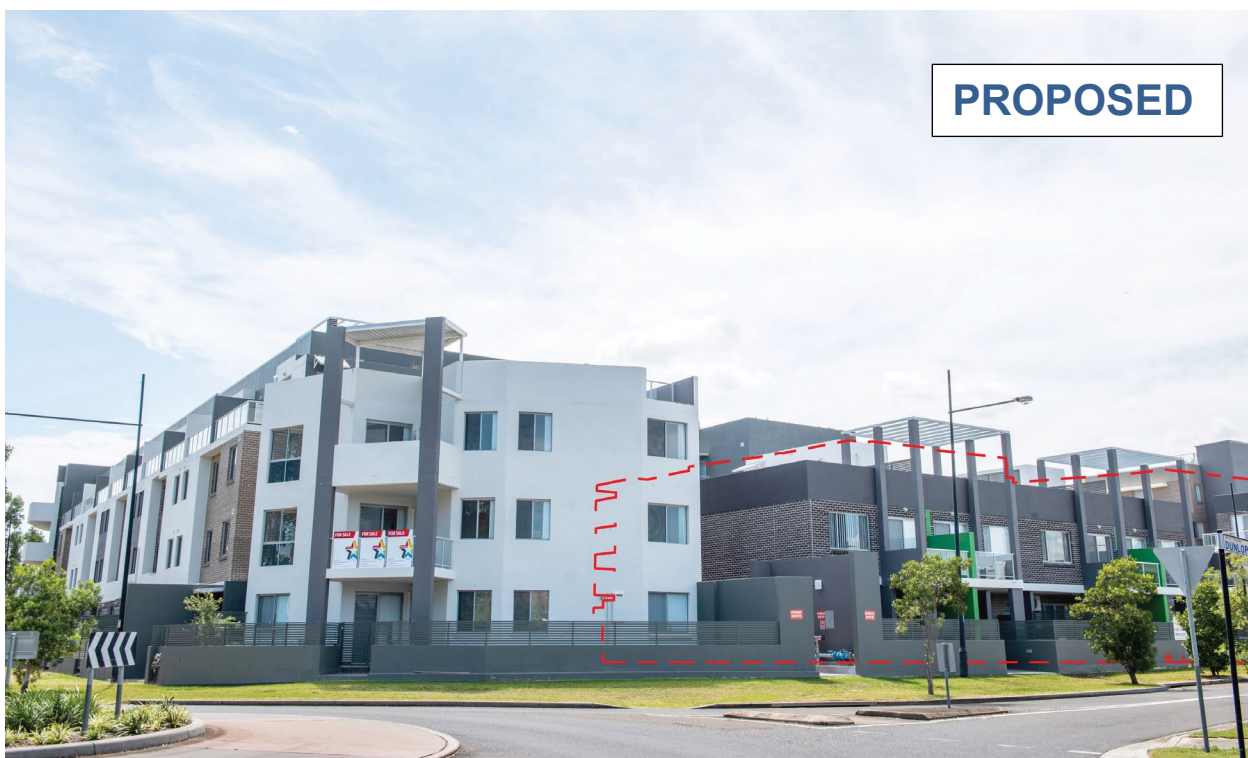
Figure 3: Photo of the existing site taken from the roundabout at the intersection to the south-west of the site (Ropes Crossing Boulevard and Dunlop Avenue) looking north-east (above).

Photomontage showing that the proposed development (outlined in red) will not be visible as it is located behind the existing 4 storey residential development. The proposal is shown as viewed from the roundabout at the intersection to the south-west of the site (Ropes Crossing Boulevard and Dunlop Avenue) looking north-east (below).