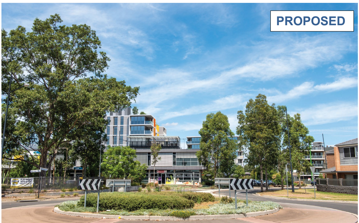
Figure 2: Photo of the existing site taken from the roundabout at the intersection to the north of the site (Ropes Crossing Boulevard and Rafter Place) looking south (above).

Photomontage of the proposed development taken from the roundabout at the intersection to the north of the site (Ropes Crossing Boulevard and Rafter Place) looking south (below).