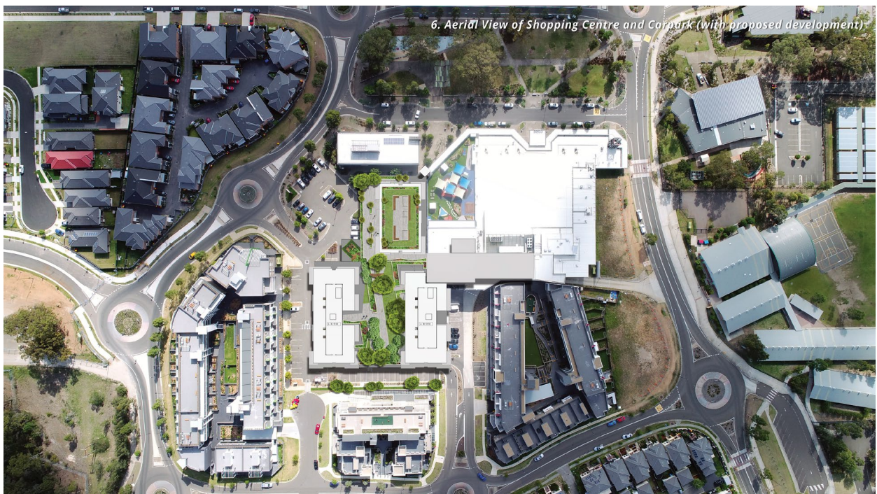
Figure 6: Aerial photo of the existing site and surrounding retail / commercial and residential developments and Ropes Crossing Public School (above). Aerial photomontage of the proposed development. The surrounding retail / commercial and residential developments and Ropes Crossing Public School are also shown (below).