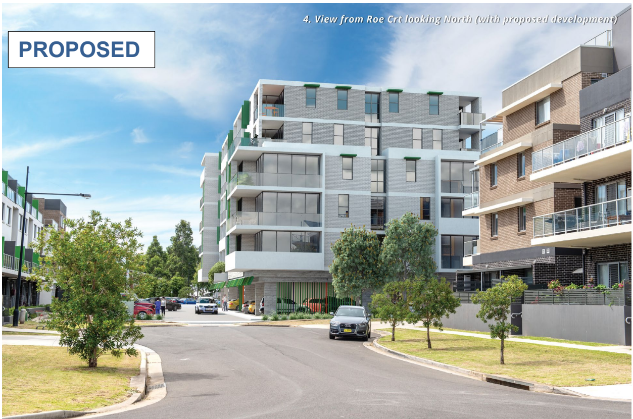
Figure 4: Photo of the existing site taken from the intersection to the south of the site (Roe Court and Dunlop Court) looking north (above).

Photomontage of the proposed development taken from the intersection to the south of the site (Roe Court and Dunlop Court) looking north (below). The existing 4 storey residential developments are shown on the right and left.